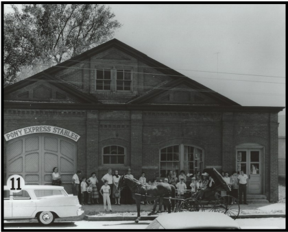
The Grand Opening of the Pony Express Museum on April 3, 1959.