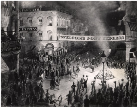
Triumphant arrival of the First Pony Express rider reaching Sacramento, California on April 13, 1860.